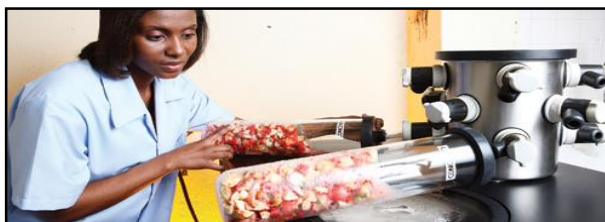
A lecturer conducting research on a Food Chemistry project

Graduates may also pursue research-based studies in areas such as Catalysis, Theoretical Chemistry, Natural Products Chemistry, Organic Synthesis, Food Chemistry, Bayer Process Chemistry, Materials Chemistry, Computational Chemistry or Chemical Education among others. These courses lead to M.Phil or Ph.D. degrees.