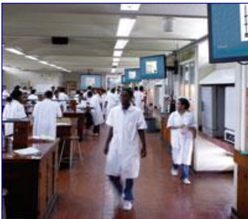
Students doing experimental work in the Undergraduate Lab

It should be noted that passes in two 3-credit Introductory Level Mathematics courses are required for entry to a major in Chemistry. Admission to Introductory Mathematics courses require passes in both units of CAPE Mathematics (or equivalent) or alternatively, passes in two 6-credit Preliminary Math courses taken here at UWI.