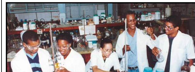
Advanced students engaged in interesting laboratory work

Some of our courses are supported by field trips to industry, to high-tech analytical facilities and even to water treatment and power generation plants. Our Applied Chemistry majors learn to operate pilot-scale industrial equipment and study the chemical engineering principles on which they are based. Similarly, our Food Chemistry majors may learn how to produce smoked chicken, cereals, banana chips or a variety of canned foods, jams or preserves using commercial equipment. Students taking our Undergraduate Research course may get to isolate new medicinal compounds or to make materials with very interesting properties.