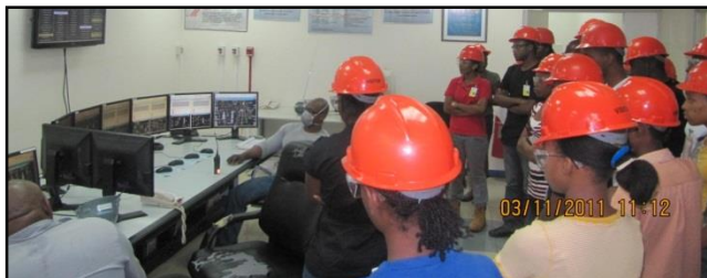
Advanced students learn process control on an industrial visit

Join us in Chemistry at UWI, Mona. Reach towards your goal and make your vision a reality.