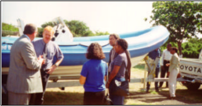
CMS receives a RIB from British High Commission (Dec 14, 2001).

Our featured Web Link for this issue is the National Environment and Planning Agency. Click on http://www.nrca.org/ and be sure too look at the EIA for the dredging of Kingston Harbour.