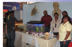
DBML staff setting up exhibit with live specimen of fish, coral and algae.