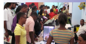
Visitors to the CMS exhibit viewing specimens of live marine organisms.