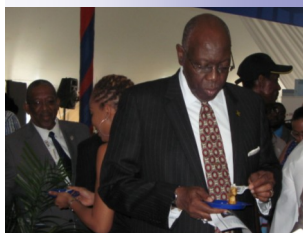
Minister of Health Hon. Dr. Fenton Ferguson sampling the Lionfish at the CMS exhibit on Research Days 2014.