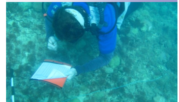
Participant recording data on corals