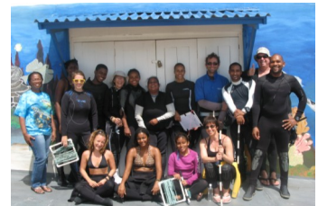
Workshop participants