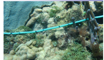
Benthic substrate assessment at Old Folly Reef