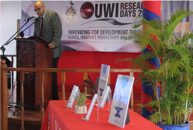
David Tennant making his presentation