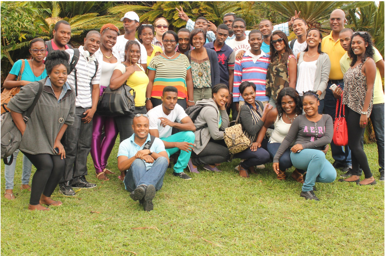
Annual Graduate Picnic (October 31, 2014)