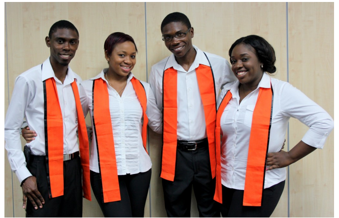
Graduate students (Finance Symposium)