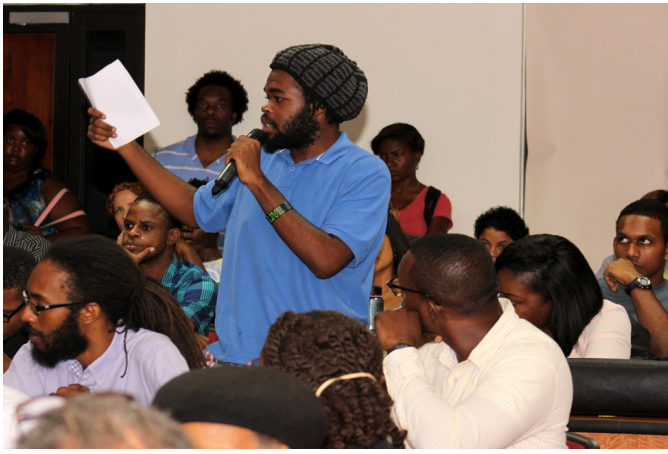
Q & A Session (Ganga Symposium)