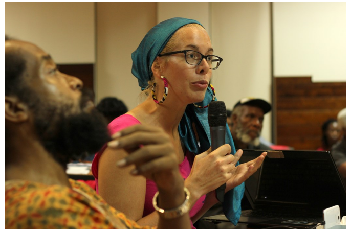
Q & A Session (Ganga Symposium)