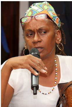
Q & A (Ganga Symposium)