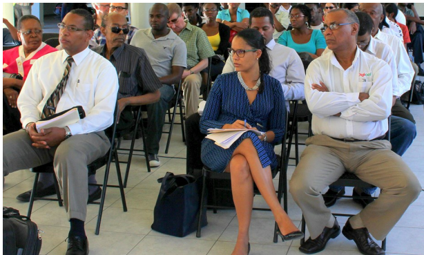
Audience (Telecommunications Public Forum)