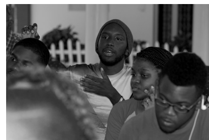
Students during the Q&A