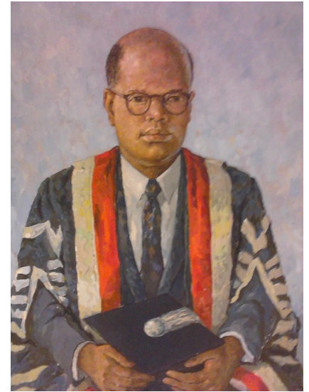
W. Arthur Lewis' official portrait as Vice Chancellor, The UWI.