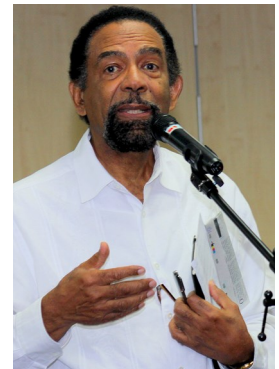
Q & A (Finance Symposium)