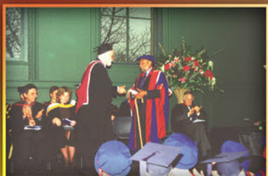
Convocation at the Tavistock Institute for his Honorary Professorship