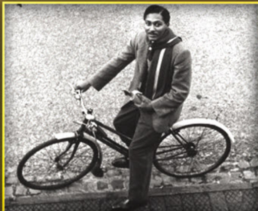
Stuart Hall as an undergraduate at Merton College, Oxford, 1953

IN 1951 , Hall migrated to England, fulfilling aspirations to study there. His mother accompanied him when he went up to Oxford. According to Hall, she handed him over to the college scout saying: "There is my son, his trunks, his belongings. Look after him."