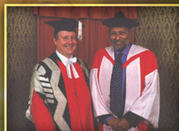
Conferred with Degree of Doctor of Civil Law honoris causa from the University of Durham 9 December 2000