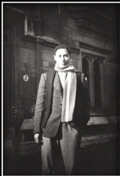
As an Oxford undergraduate outside Merton College

Issues of identity, race, ethnicity and culture were also to become lifelong and passionate interests. A critic of British media and British treatment of Black immigrants, he would eventually be widely regarded as the founder of British cultural studies.