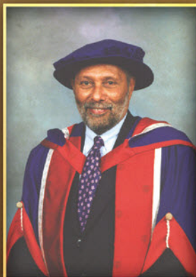
D. Litt. Hons. Graduation ceremony, University of East London