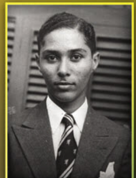
Rhodes Scholar 1950 at King's House Jamaica