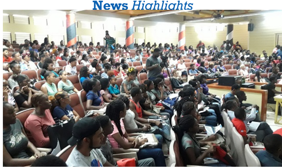
MSBM Welcomes New Students

In this issue we highlight the activities of the School during the period April 2019 - September 2019. During this period, the School made significant strides through a range of initiatives and programmes. As you read through this interactive issue of MSBM eNews, click the links for more information.