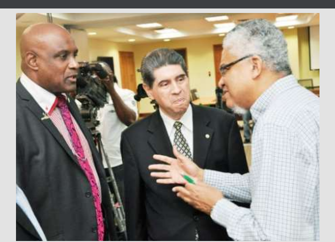
MSBM collaborated with members of the University community and the Caribbean Maritime Institute to organize a symposium: "The Jamaica Logistics Hub: "The Economy Vs. The Environment?" held at the UWI Regional Headquarters. Discussions were rich and well received by those who attended, many of whom expressed having gained a better understanding of the hub <u>Read More</u>