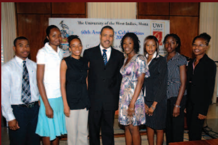
Top: Prime Minister Bruce Golding attends the ceremony to launch Mona's 60th Anniversary celebrations