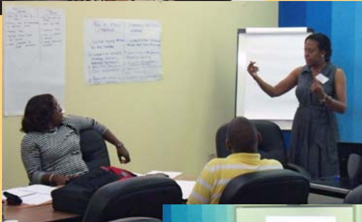
An academic staff member demonstrates her newly gained skills during the micro teaching segment of the IDU'S annual Teaching Skills Workshop.