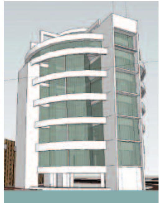
Architect's impression of the proposed Social Sciences building

The Students Union has long outlived its usefulness to students of this 70 year-old institution. The Campus plans to develop a Student Centre that will cater to all student needs, with a strong focus on student