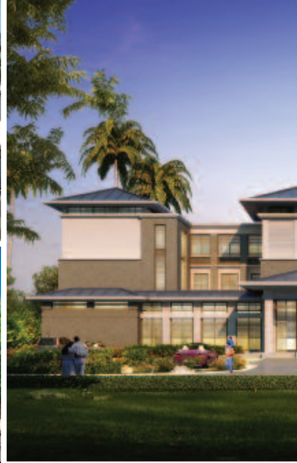
Architect's impressions of the proposed buildings: (L-R) Student Centre, Confucius Institute, Hartmont property (Western Jamaica) and UWI Mona Athletics Stadium

centeredness, including unhindered access for the physically challenged, internationalisation and cultural diversity within the student population. The facility will integrate and encourage educational, social, recreational and cultural interactions. The development will include eateries and a supermarket, meeting rooms, access to internet, commuting student lounge, general student lounge, administrative offices, a multi-purpose amphitheatre, satellite location for essential student services, parking, and circulation for buses.