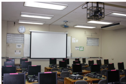
FSS Computer Lab - DOMS

Suggested usage: training requiring computers, workshops, internet connectivity, conferences