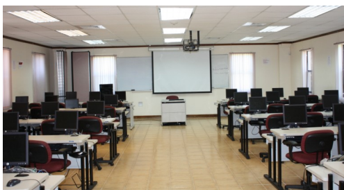
FSS Computer Lab - 6

Suggested usage: training requiring computers, workshops, internet connectivity, conferences